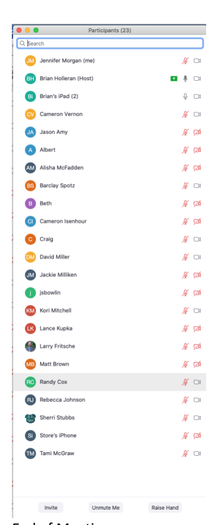
End of Meeting